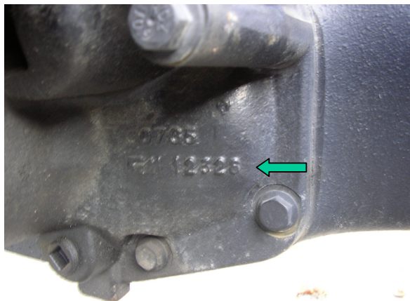
Figure 3 – Differential Support